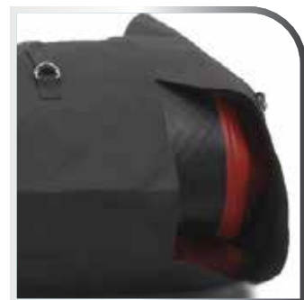
Heavy duty fabric build