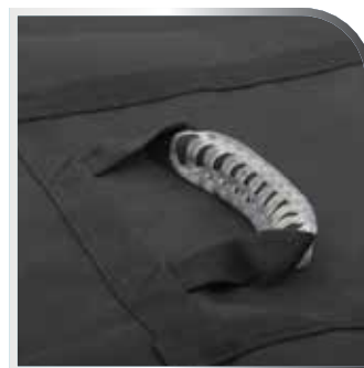
Comfort carry handles